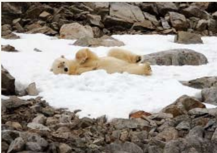
Top to bottom: Approaching pack ice at Seven Islands, north of Svalbard, 800 miles north of mainland Norway. A polar bear lounging, spotted at the northwest corner of Spitsbergen, Svalbard. Documenting the glacier at exactly the same spot that prince Albert I of Monaco photographed the glacier in 1906.