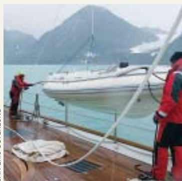
Top to bottom: One of the three tenders carried aboard is launched for some near-shore exploration at Svalbard. Adèle anchored at this ancient church in Nærøyfyord. Hanging out with the walrus in Seven Islands, north of Svalbard.

The next morning found us at anchor and protected from pack ice. Snowflakes covered the deck, making our Cayman Islands flag look somewhat out of place. We continued south with just main and mizzen doing 11 knots; once the genoa was set, our speed increased to 14 knots. When the wind abated a little after lunch, »